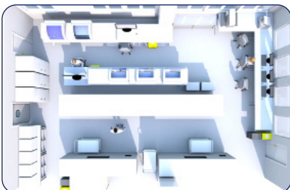
Example of deliverable: Lay out