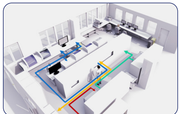
Example of deliverable: Visual Workflow